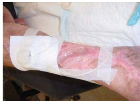
Figure 5. A version of the PRFE device is shown in use on a patient with a venous stasis ulcer.

and 1000 Hz pulse rate. Figure 4 shows the latest version of the PRFE device and Figure 5 shows the application of the PRFE device on a patient with a venous stasis ulcer; prior to PRFE therapy this patient was considered for