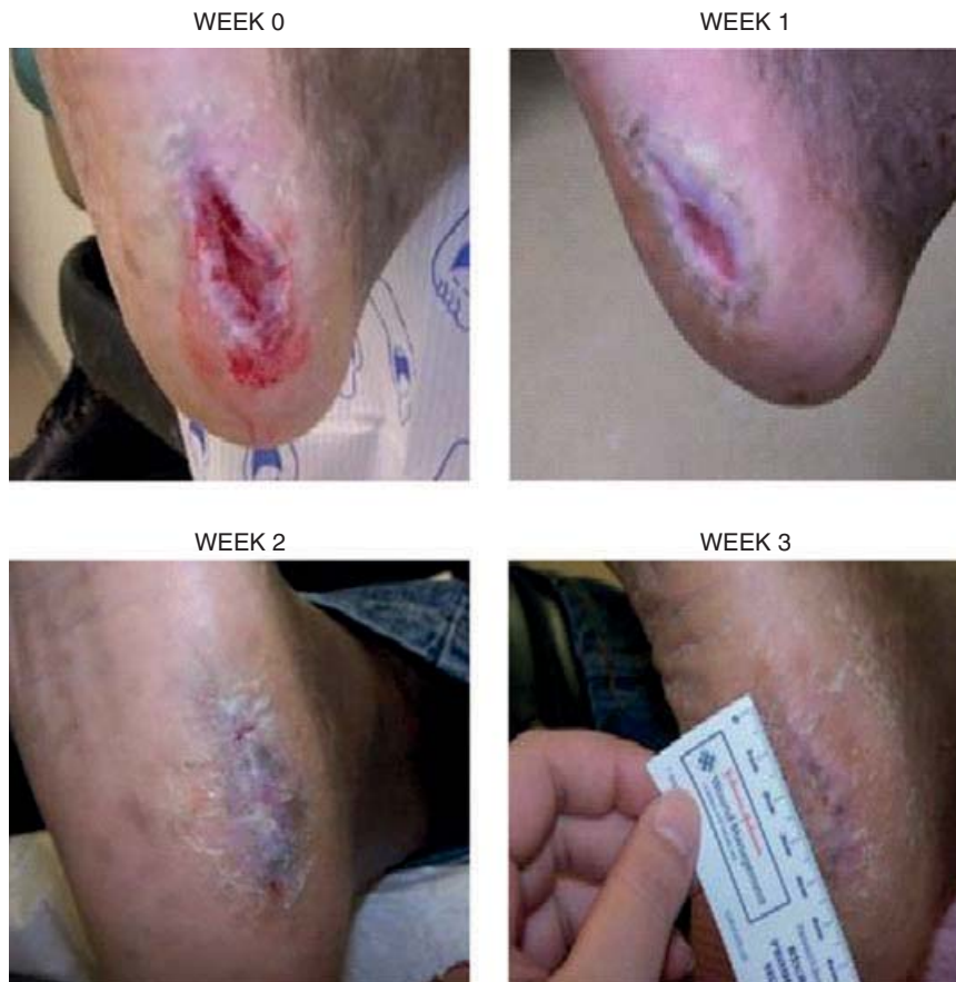
Figure 3. Patient 3 had a 4.0 × 1 cm diabetic ulcer on the left heel. After 3 weeks of PRFE treatment the ulcer had completely healed. The ulcer is shown at weeks 0, 1, 2 and 3.