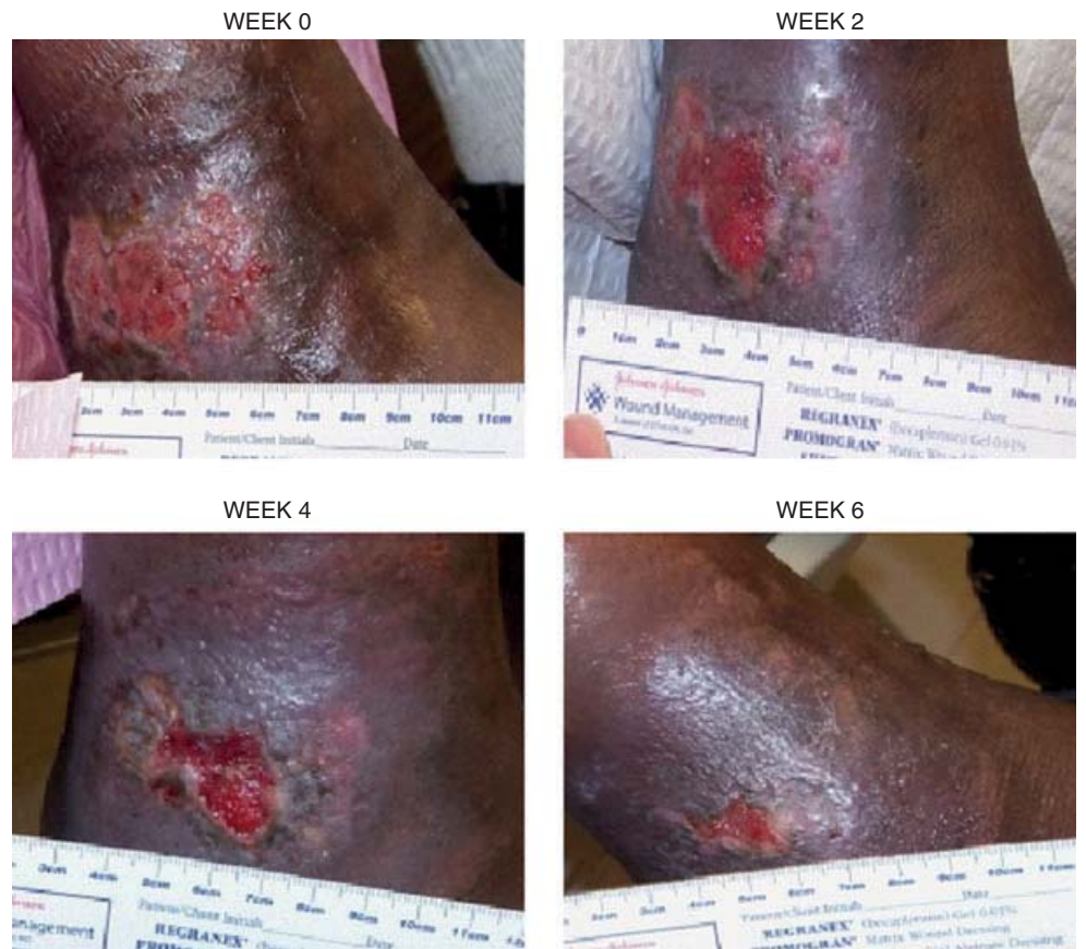
Figure 1. The venous stasis ulcer of patient 1 is shown at weeks 0, 2, 4 and 6 of PRFE treatment. Significant pain relief was reported by the patient after 2 weeks treatment. The ulcer had decreased in size from 4.0 × 2.5 cm to 0.7 × 0.5 cm after 6 weeks PRFE treatment. The ulcer continued onto healing using the PRFE therapy.