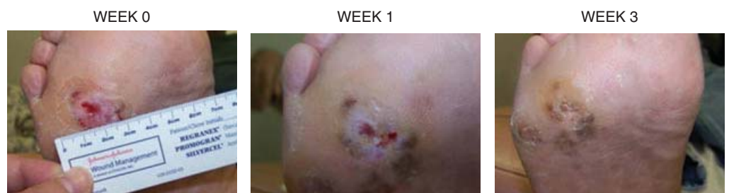
Figure 2. Patient 2 had a 0.5 × 0.5 cm diabetic ulcer at the beginning of PRFE treatment, which healed after 3 weeks PRFE therapy. The ulcer at weeks 0, 1 and 3 is shown.

used 3 hours per day. More recently clinical trials on the postoperative recovery after breast augmentation surgery (18) and breast reduction surgery (19) have clearly demonstrated the control of postoperative pain with newer versions of wearable, portable PRFE devices.